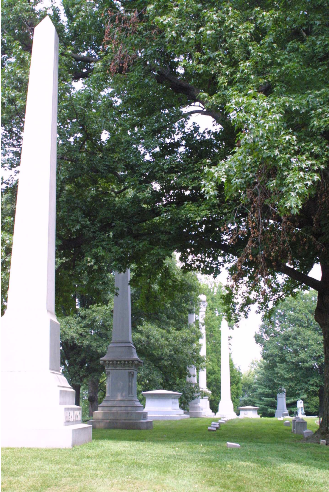
Bellefontaine Cemetery and the Roman Catholic Calvary Cemetery are adjacent burial grounds in St. Louis. They have numerous huge tombstones and monumental mausoleums. They contain the burials of a number of famous people, one of whom is George E. Kessler.