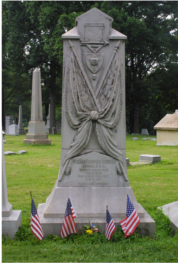
Civil War general William Tecumseh Sherman is buried in the adjacent Calvary Cemetery (the Roman Catholic area).